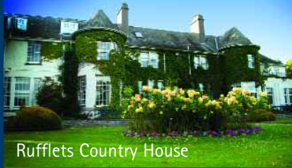
Rufflets Country House

HOLYROOD apartHOTEL offering a level of attention and service for guests who appreciate quality, authentic style and genuine courtesy, they offer an entirely different accommodation experience"