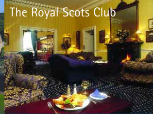
The Royal Scots Club